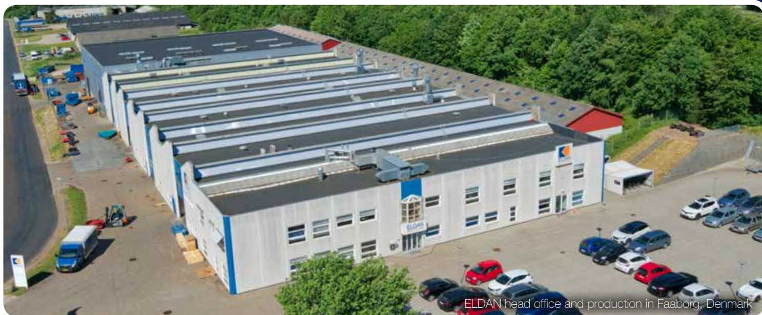
ELDAN head office and production in Faaborg, Denmark