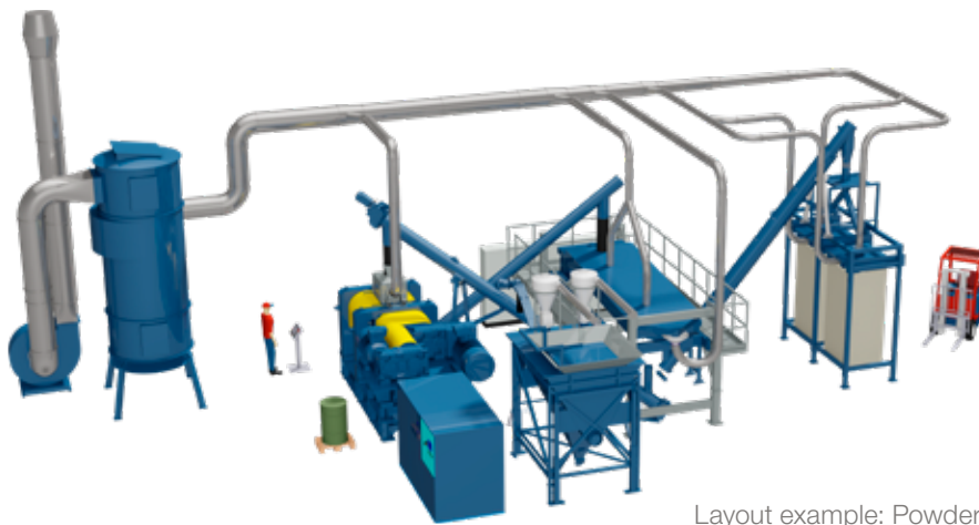
Layout example: Powder Plant

Used for bagging of the end-product. Eldan offers single and double bagging stations, Weighing and scaling equipment is also available.