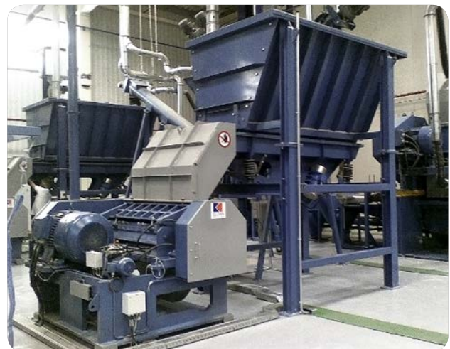
Fine Granulator as a part of a tyre recycling system. Feeding via a Silo (V4) to ensures optimum utilization of the capacity.