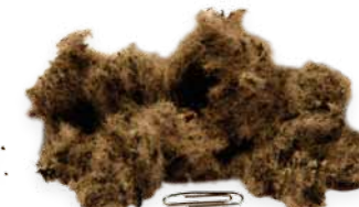
Textile (after PC10T)