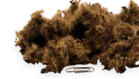
Textile (after PC15)