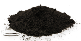
Final product - 99.9% purity